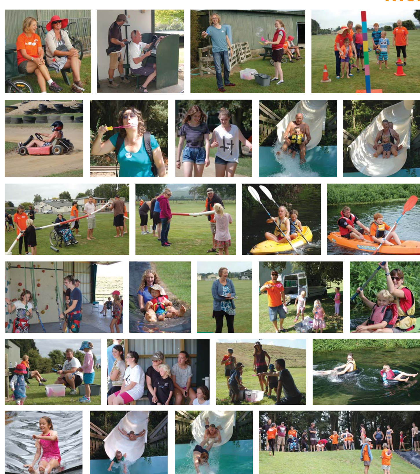
MS Waikato would like to thank the New Zealand Community Trust and the Rehabilitation Welfare Trust for their generous support in assisting to fund the camp.